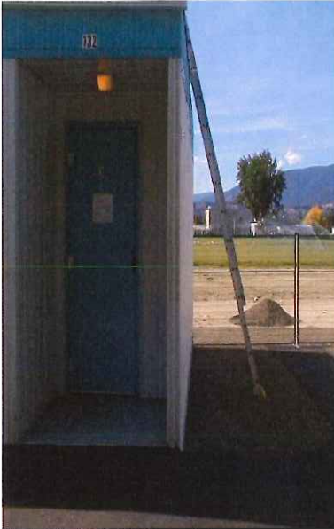
Proper 4 to 1 set-up outside a portable