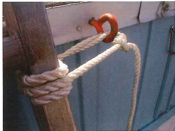
Best Practice Note: Tie-offs with separate nylon ropes to eyebolts left & right.