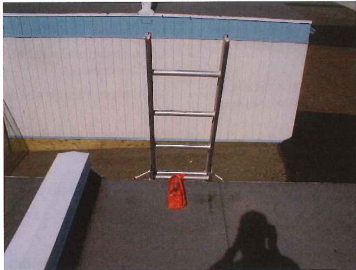
Ladder tied-off with rungs well above roof