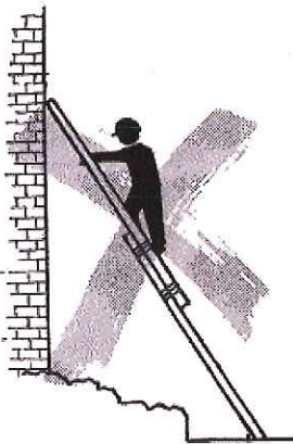
Instability - Base of ladder positioned too far from wall. Sudden slipping can occur.